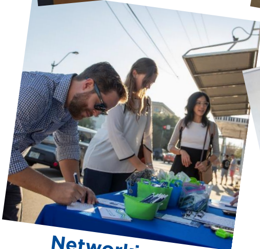
Networking & Partnership Events