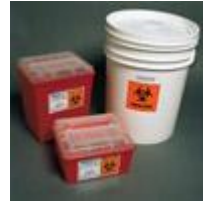
Labeled White 5 Gallon Pail or Red Sharps Container*