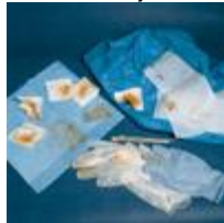
Biohazardous Waste that Will Not Puncture Skin