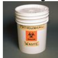
Labeled White 5 Gallon Pail*