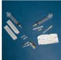
Biohazardous Sharps (Syringe with Needle, Scalpel, etc.)