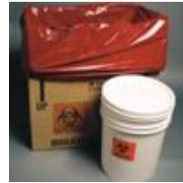
Labeled White 5 Gallon Pail or Biohazard Box with Red Bag*

Pathological Waste (Human Organs and Tissues, etc.)