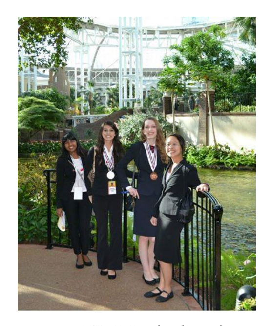
NLC 2013 Opryland Hotel Nashville, TN

Members are chosen to represent their chapter in the Regional competitions