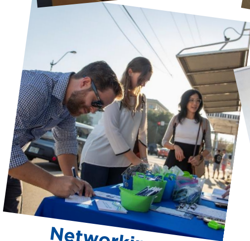
Networking & Partnership Events