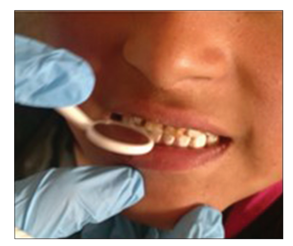
Figure 2: Visual dental examination using a mirror

Using CAMBRA, we were able to reveal the high burden of dental decay in the children of these three rural communities in Ecuador. Our findings bring to light areas for future research. Studies that assess the impact of socioeconomic and cultural factors on dental caries in these rural communities are needed