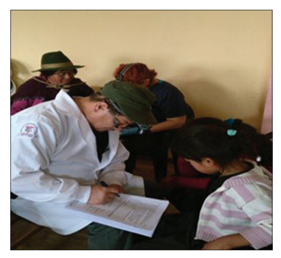
Figure 3: Dentist using a headlamp in preparation for the oral examination

to improve the understanding of the root causes for dental caries risk. Since CAMBRA is a fairly new tool used as a protocol for caries management, more systematic reviews are needed to obtain a consensus on the protocol to be used for data collection, analysis, and reports of the findings. Finally, additional research is needed to assess whether utilizing the CAMBRA protocol contributes to long-term caries prevention.